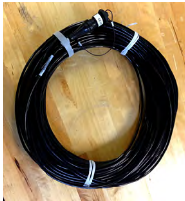
KMS-115 electrode extension cable

KMS-115 Electrode 50 m or 75 m extension cable