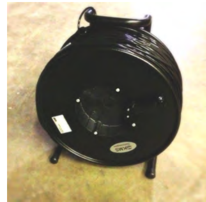
KMS-115 electrode extension cable (on the reel)

The KMS-115 electrode extension cable is used to provide connection from KMS-820 acquisition unit (the electrode transition cable) to electrode for electrical field measurement. The standard cable lengths of the cable are 50 and 75 meters. Other lengths are available upon request.