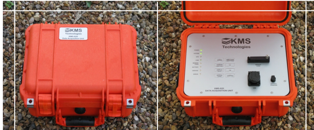
Figure 1: KMS-820 data acquisition unit.

The KMS-820 Data Acquisition Unit (DAU) is developed for ElectroMagnetic (EM) and seismic applications to obtain subsurface resistivity and velocity structure for oil and gas exploration. It can also be used in general purpose acquisition, microseismic monitoring , and long term monitoring services.