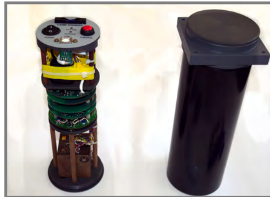
Figure 1: LEMI-026 system with and without hosing cover.