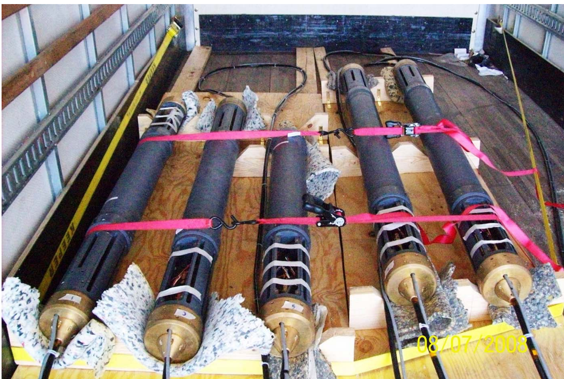
Remote Acquisition Unit (RAU)