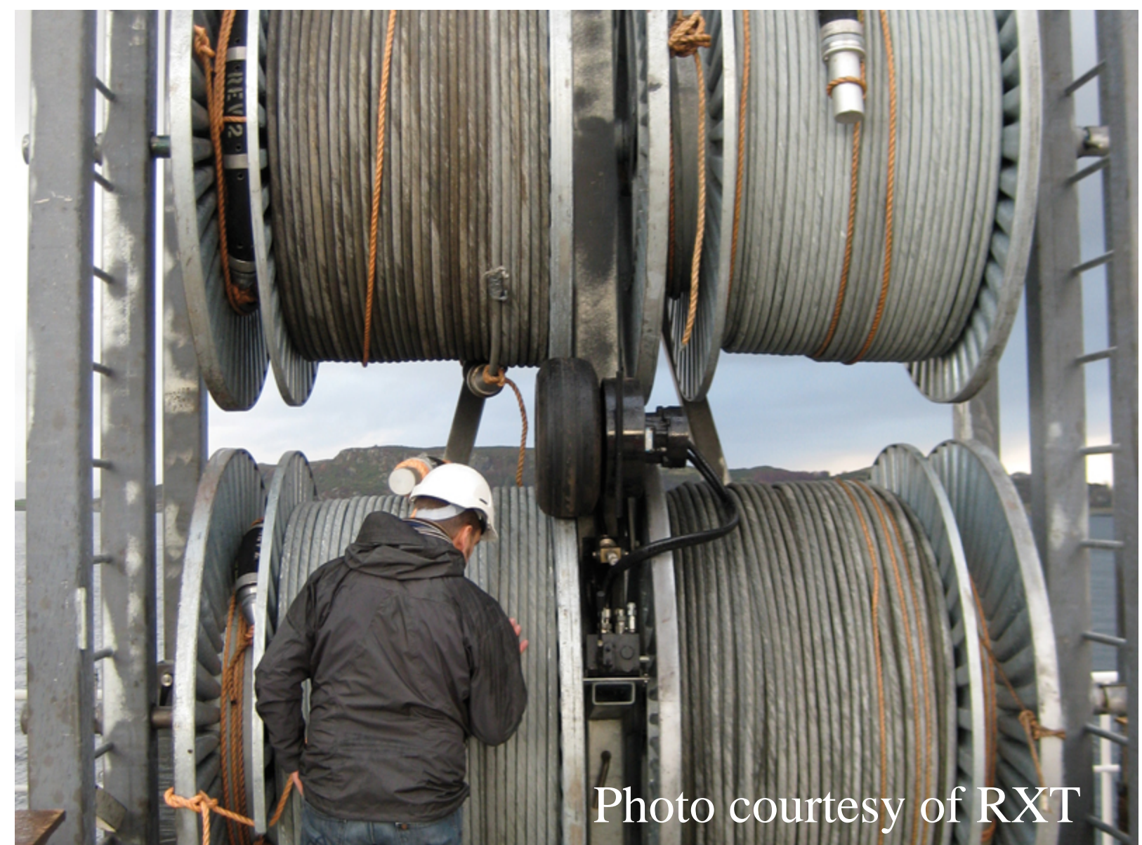
Cable system for deployment