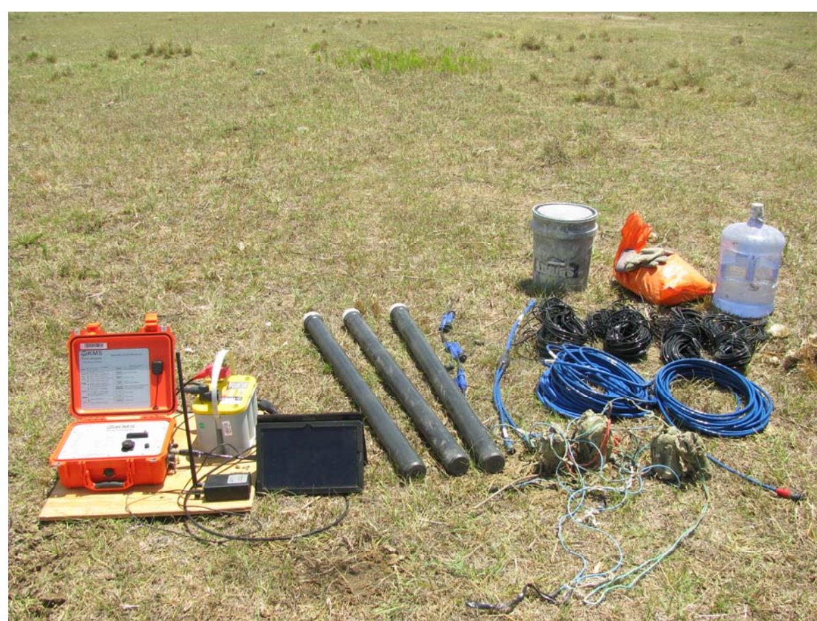
KMS MT system in the field