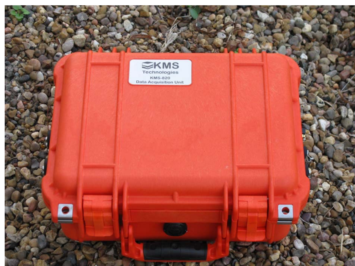
KMS-820 data acquisition unit