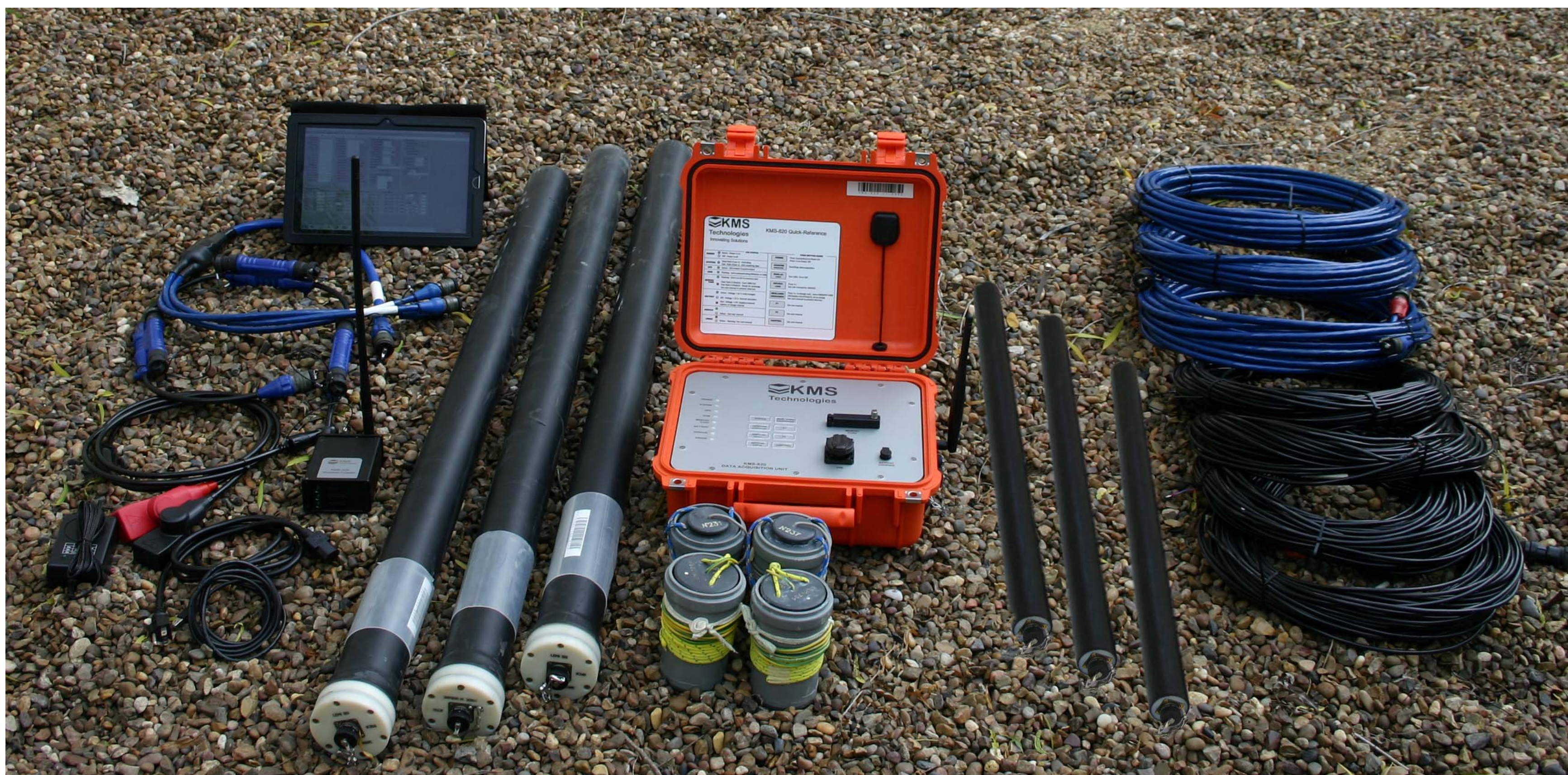
Magnetotelluric (MT) data acquisition system